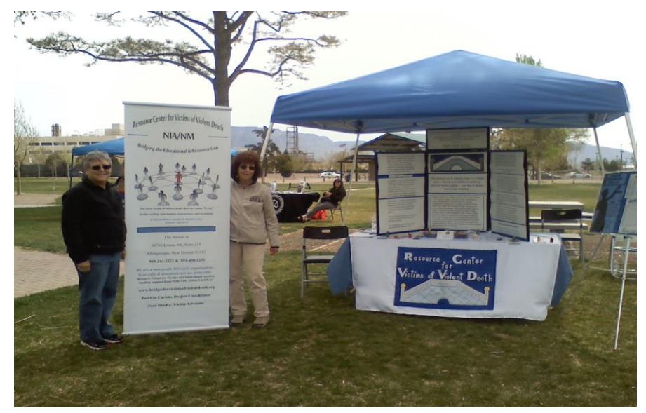
The Resource Center out in the community

Thanks for visiting us at Civic Plaza during Victims Rights week, at South Valley Pride Day, and at the park event in Rio Rancho. We hope you got helpful information.